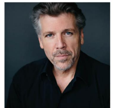
Thomas Hampson