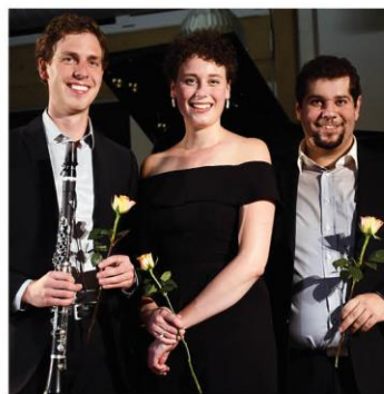
Trio tRiaLog