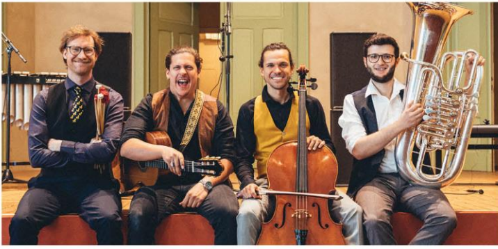
The Erklings